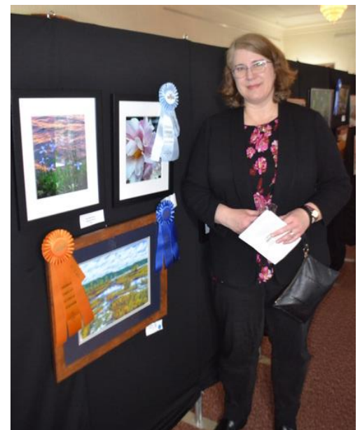
Best of Show "Coolbaugh Theme"