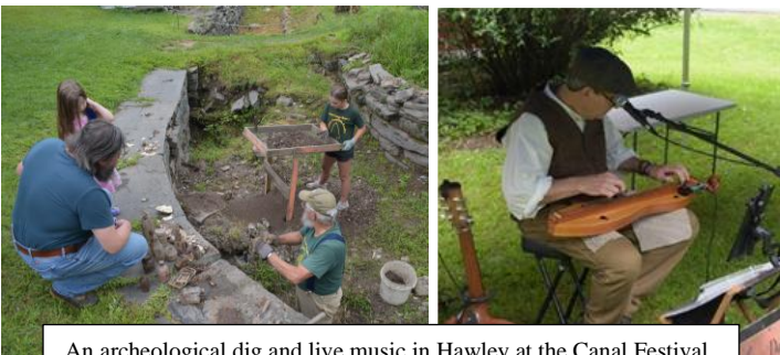
An archeological dig and live music in Hawley at the Canal Festival

At the D&H Canal Park, the CTHA hosted a booth featuring historical photos, artifacts, and displays, showing insights into Coolbaugh Township's history and heritage.