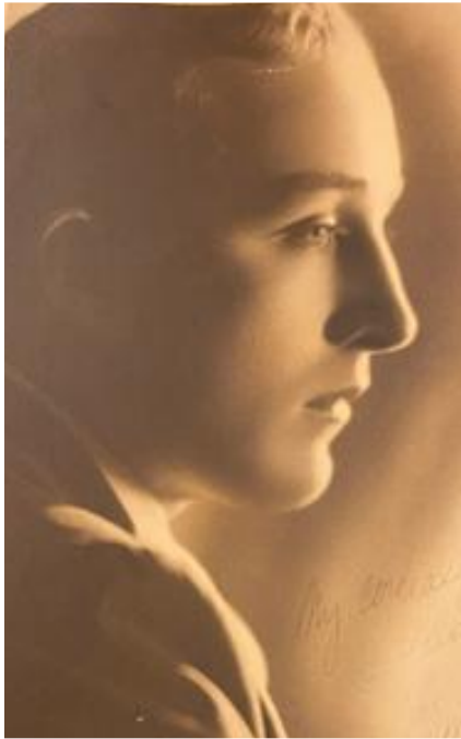
Above: An image of Bing Crosby