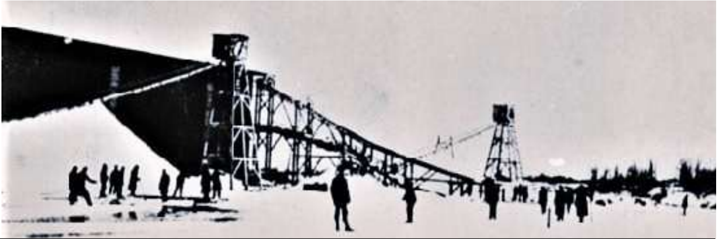
Ice House #3, Tobyhanna.

Join us for a walking tour of this site and more. Sunday April 12, 2:00 PM. at the Tobyhanna State Park History & Nature Hike Tobyhanna No. 2 and No. 3 Icehouses