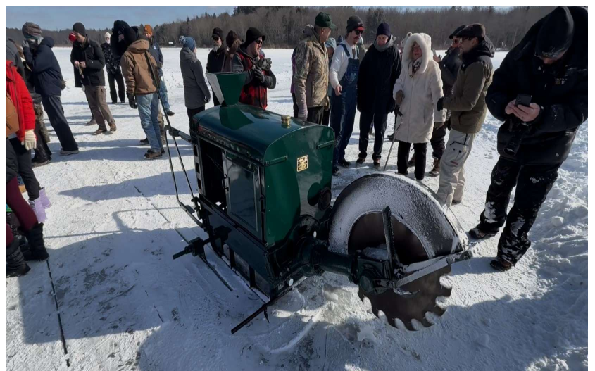
Observers admiring the restored antique Ice Saw on Mill Pond #1

Since its founding in 1993, the CTHA has pledged itself to preserving, interpreting and encouraging community interest in the unique history of the Coolbaugh Township area to ensure that present and future generations can share in and understand their rich heritage.